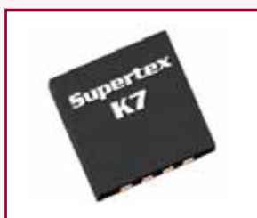
8-Lead DFN (K7)