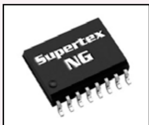
16-Lead SOIC (NG)