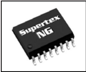
16-Lead SOIC (NG)