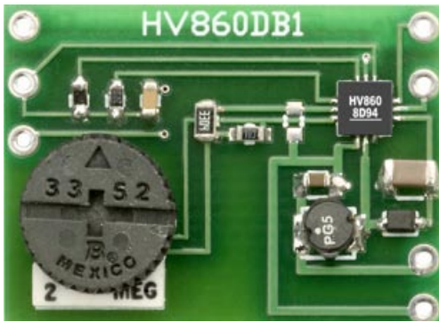
Actual Dimensions: 20mm x 25mm