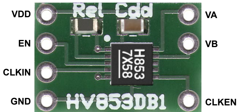
Actual Dimensions: 13mm x 8mm