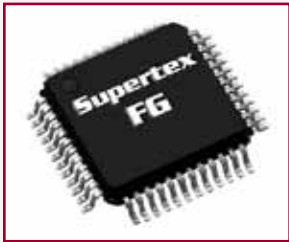
48-Lead LQFP (FG)