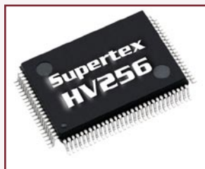
100-Lead MQFP (FG)